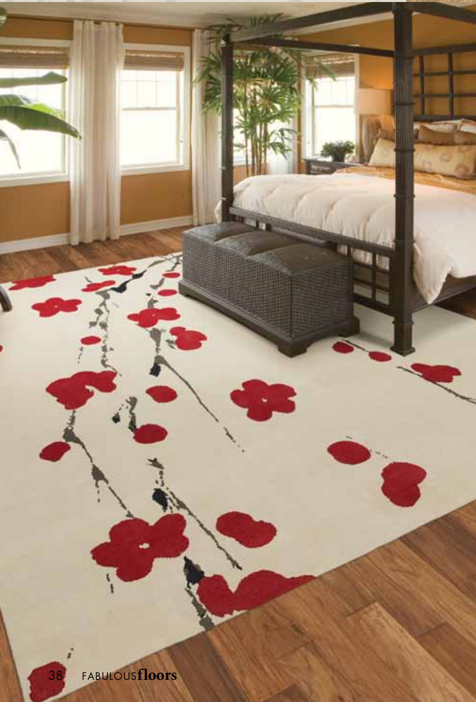
Above: KingstonCrossing_StrawCream_8x10. Left: IDG_woolequities_RS. Background: Riverton_SkyBlue_8x10.